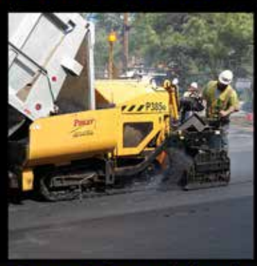
With over 50 years in business servicing the Mid-Atlantic Region, Finley Asphalt and Concrete has worked hard to earn a reputation as a major commercial contractor of asphalt, concrete, and incidental services