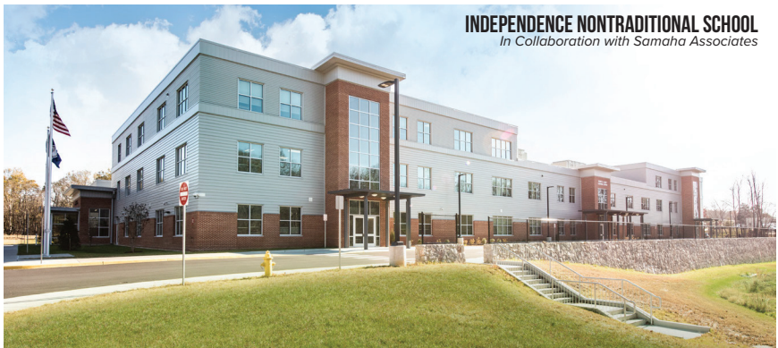
INDEPENDENCE NONTRADITIONAL SCHOOL In Collaboration with Samaha Associates

BUILDING THE FUTURE, ONE SCHOOL AT A TIME